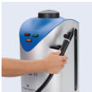
Ergonomical handpiece, ready to hand