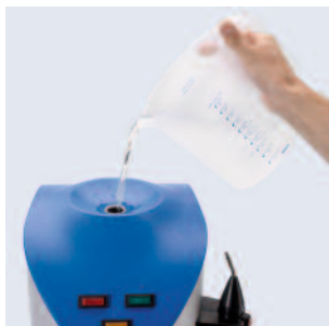
Refill without a funnel

Dimensions d/l/h: 275 x 265 x 455 mm Weight: 12,5 kg Mains supply: 230 V / 50 Hz Machine rating: 1600 W / 1000 W E-fuse: T10A Boiler volume: 3.7 l Vapor pressure: 4.0 bar Warm-up time: approx. 25 min